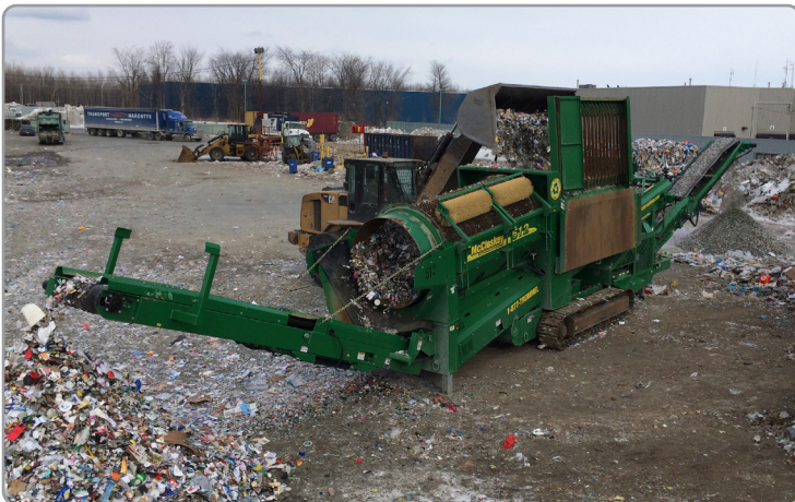
512RT shown with optional Tipping Grid & Spill Plate

HOPPER CAPACITY Hopper capacity of 4.5yd 3 - 7.0yd 3 with extensions for greater efficiency.