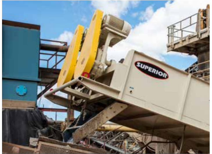
04/ FULLY-GUARDED DRIVE SYSTEM