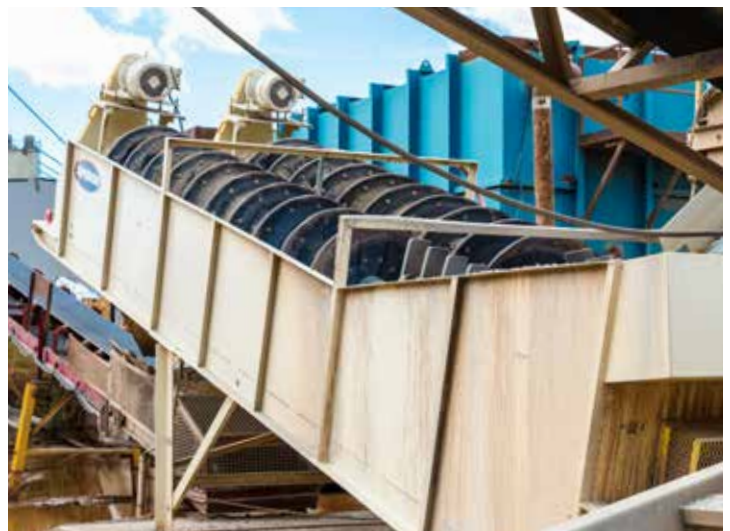
06/ SINGLE OR TWIN SCREWS