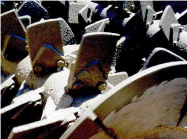
01/ A-532 WEAR PADDLES