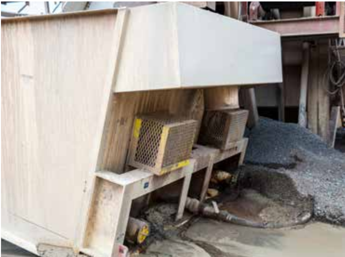
03/ GUARDED OUTBOARD BEARING