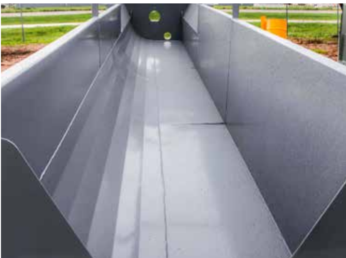
05 / CURVED BELY PAN