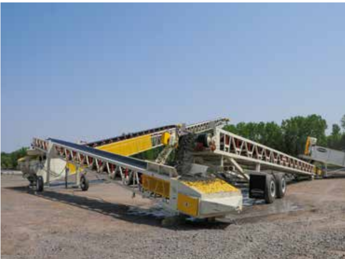
SLIDE-PAC TRANSFER CONVEYORS

Quickly and Safely Roll Conveyors From Transport to Operation Instead of Risky Lifting