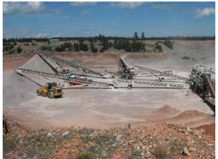
SLIDE-STAC CONVEYOR STOCKPILING