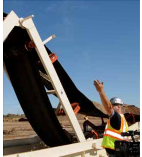
ROLL ON OR OFF DOVETAIL