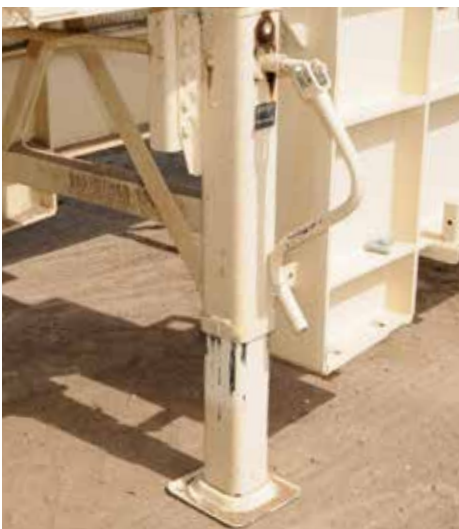
CRANKDOWN LANDING GEAR