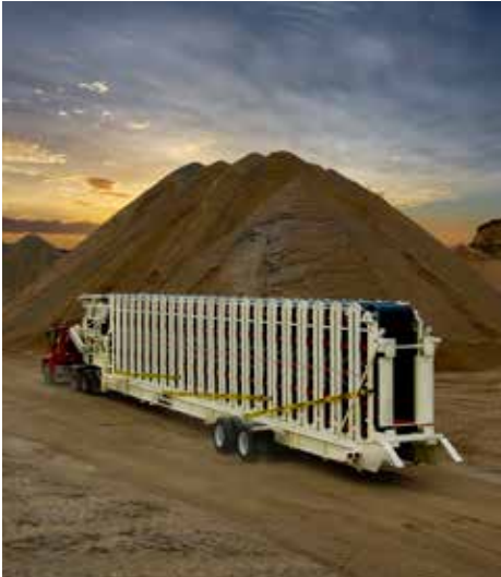
84-FT (25.6M) PACKAGE