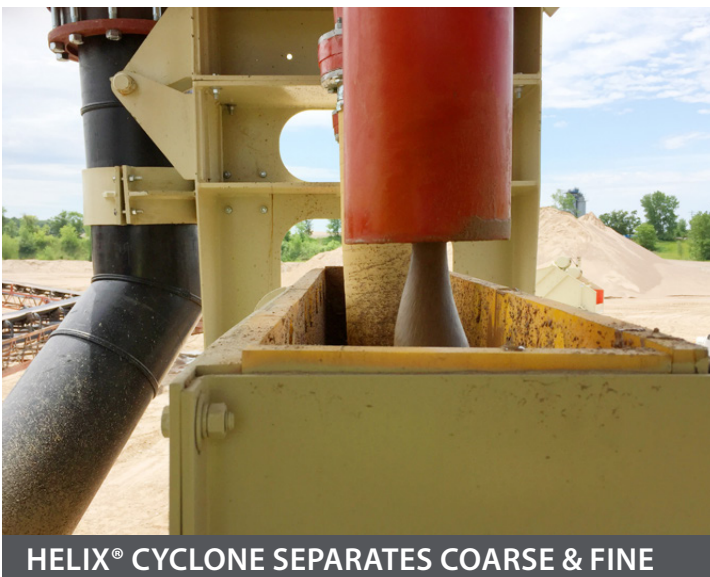
HELIX® CYCLONE SEPARATES COARSE & FINE

Structural package consisting of sump pump, cyclone and dewatering screen.