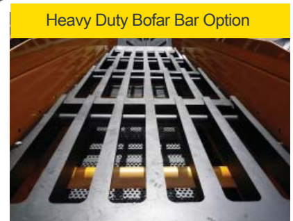
Heavy Duty Bofar Bar Option