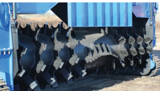
Large diameter drum maximizes homogenization and oxygenation of the windrow material.