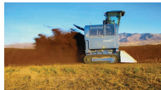
Independently controlled track clearers guide material to the drum and "float" to fit any pad.