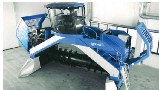
A fold-out work platform gives technicians clear access to the machine's components.