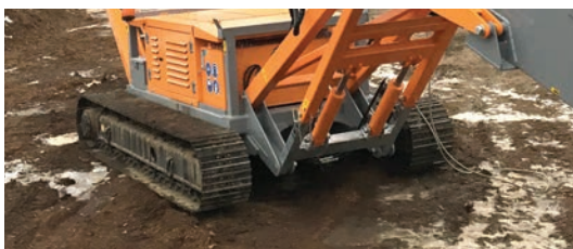
Self-diagnostic CAN bus system provides real-time feedback and alarms displayed in text format.

Regardless of the feedstock, the A75 sets new standards in power, performance, efficiency and handling.