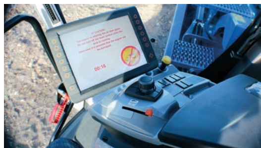
The single-joystick control, load-sensing and touchscreen display make for easy operation.